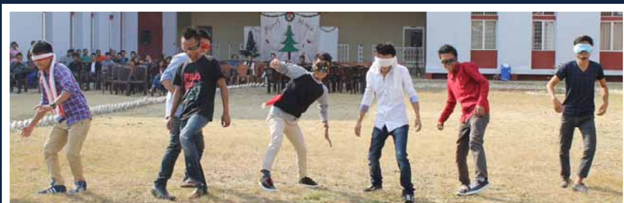
Photos from top-to-bottom: (1) Tug-of-War, (2) Special Dance by the students of BCA 3 rd Semester, (3) Participants in the Talent Show, (4) Blind-folded Race. (Photos taken by: Md. Hamidul Islam, BA 3 rd Semester) .