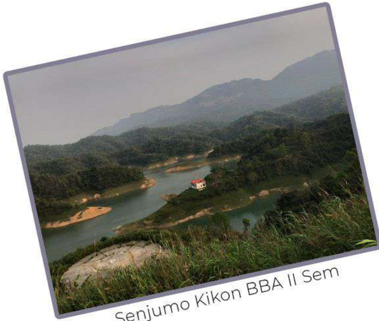
Senjumo Kikon BBA II Sem