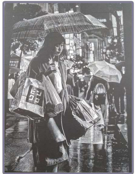
Senjumo Kikon BBA II Sem