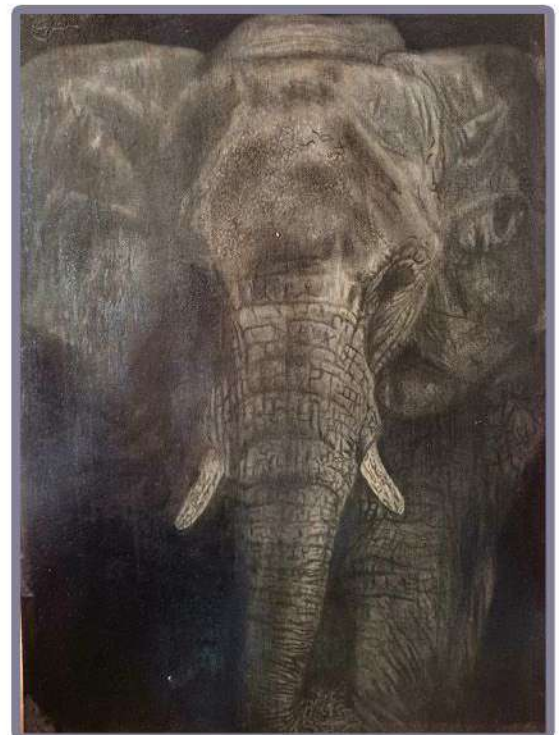
Reguiheibe Ndang BCA VI Sem